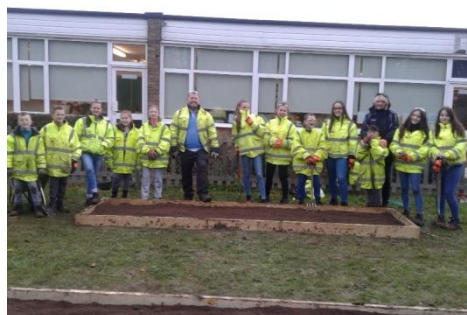
Self Esteem Enrichment projects