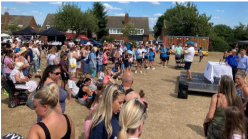
July Family Funday

We have a limited range of sponsorship packages available, placing your brand at the heart of the day. Contact us for a full list of options before they get snapped up!