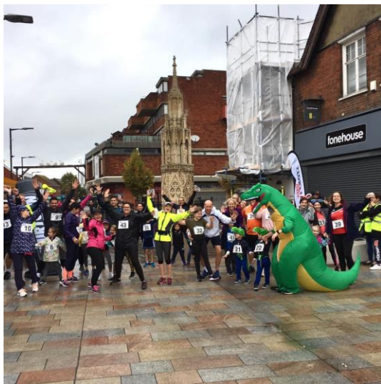
EN8 Launch run 2019