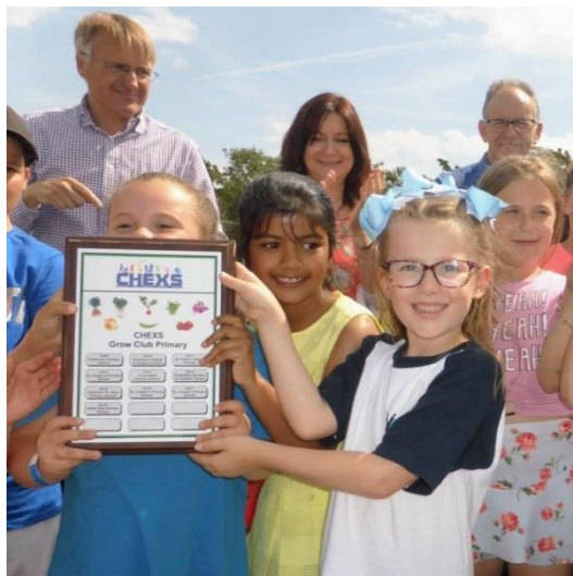
Grow Club Finale 2019